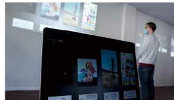
■ NFT アート作品のオークションの様子 (2021年5月20日) 2021年に落札された NFT アートの上位 10 作品の落札額の合計は 160 億超だった。

that can be copied, but only one person can own the original. You can prove that you are the owner of an NFT using a technology called blockchain. The blockchain has a list of every time an NFT was bought or sold. Bitcoin also uses blockchain, but bitcoins are different from NFTs. There are many bitcoins in the world, like paper money. This means they are exchangeable and replaceable – they are “fungible”. NFTs are unique, so there is only one of each – they are “non-fungible”. Something that is “non-fungible” has special qualities that make it unique, like a diamond with its own cuts and colors. A person can buy an NFT and sell it later for more money. In this way, it can be a kind of investment.